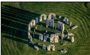
Neolithic Monuments - Stonehenge.