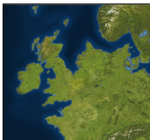
Ancient Britain was part of a huge landmass called Doggerland until 12,000 BCE.