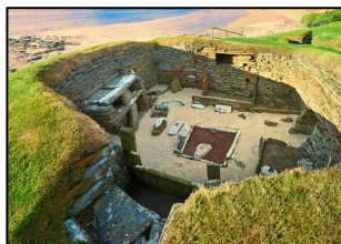
Neolithic village - Skara Brae.