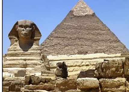
The Great Pyramid of Giza and the Sphinx.