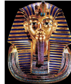
Pharaoh Tutankhamun's solid gold death mask.