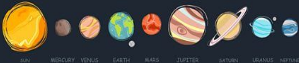
SUN MERCURY VENUS EARTH MARS JUPITER SATURN URANUS NEPTUNE