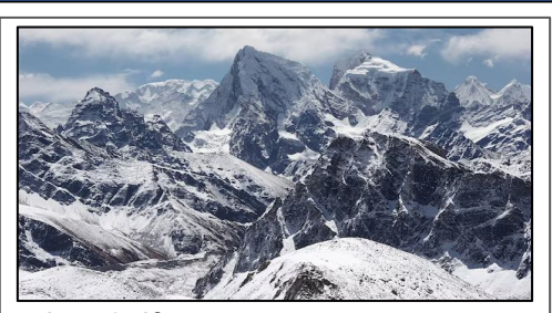
FAST FACTS! Official Name: Federal Democratic Republic of Nepal. Capital: Kathmandu. Population: 29,717,587 Official languages: Nepali, English.