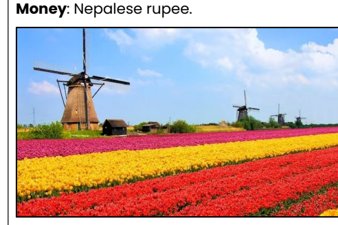
FAST FACTS! Official Name: Kingdom of the Netherlands. Capital: Amsterdam. Population: 17,151,228